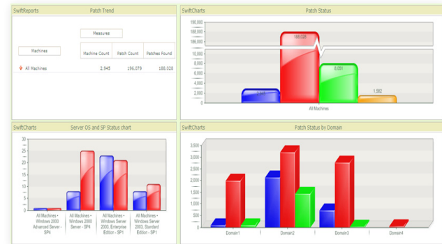
Quickly Analyze Security and Compliance Trend Data